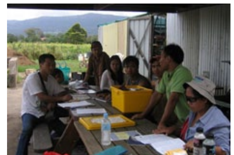
OUR MEETING 28.1.10, & SORTING OUT SEEDS TO PLANT. (SOME SEEDS FREE & OTHERS $1 PACKET)