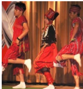
BURMESE DANCERS IN ACTION.

We had twenty two volunteers, and they contributed significantly to the Festival's fabulous recycling effort.