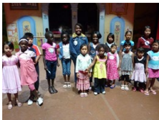
START STRUCK POTENTIAL BALLERINAS

We were kept busy during the holidays with some major outings for young people and adults.