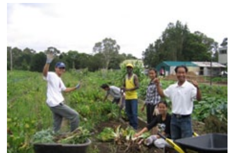
HAPPILY CLEARING OUT THE OLD SPINACH FROM BED 135.