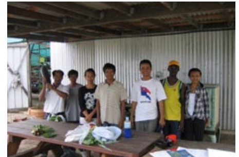
1ST DAY GARDENING, & EVERYONE HAPPY! (PRODUCE GIVEN BY FELLOW GARDENERS).

Our vision is to see refugee entrants happily settled and participating fully in the life of the wider community