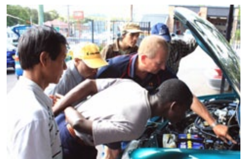
GETTING GOOD INFORMATION IN ADVANCE USUALLY SAVES GRIEF LATER!